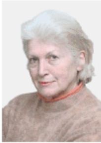
Not acceptable Portrait style photographs are not permitted