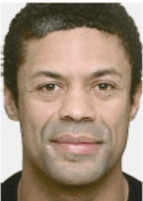
Not acceptable The subject is too close to the camera