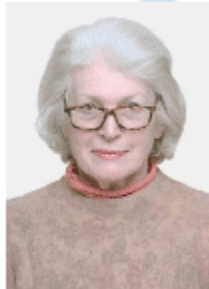
Not acceptable The glasses cover the eye