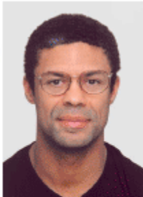
Acceptable Where possible, it is preferable to remove glasses to avoid any possibility of your photo being rejected