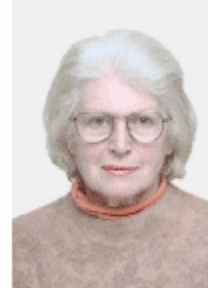
Acceptable Where possible, it is preferable to remove glasses to avoid any possibility of your photo being rejected