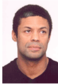
Not acceptable The subject is neither facing or looking directly forward