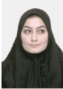
Not acceptable Although facing the camera, the subject is not looking directly forward