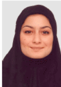
Not acceptable Even a slight smile distorts the normal facial features