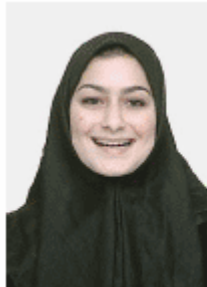
Not acceptable Laughing or smiling distorts the normal facial features