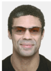
Not acceptable Dark glasses obscure the eyes, and smiling