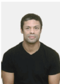
Not acceptable The subject is too far from the camera