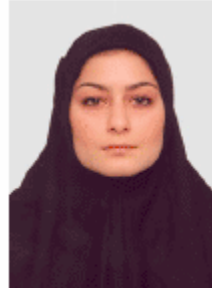
Acceptable Head coverings for religious or medical grounds are allowed