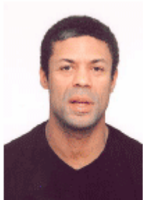
Not acceptable Opening the mouth distorts the normal facial features